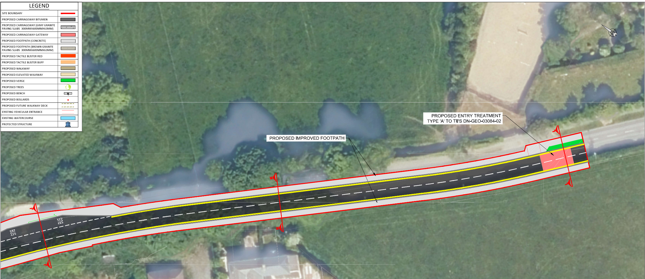
Layout plan SCALE= 1:250